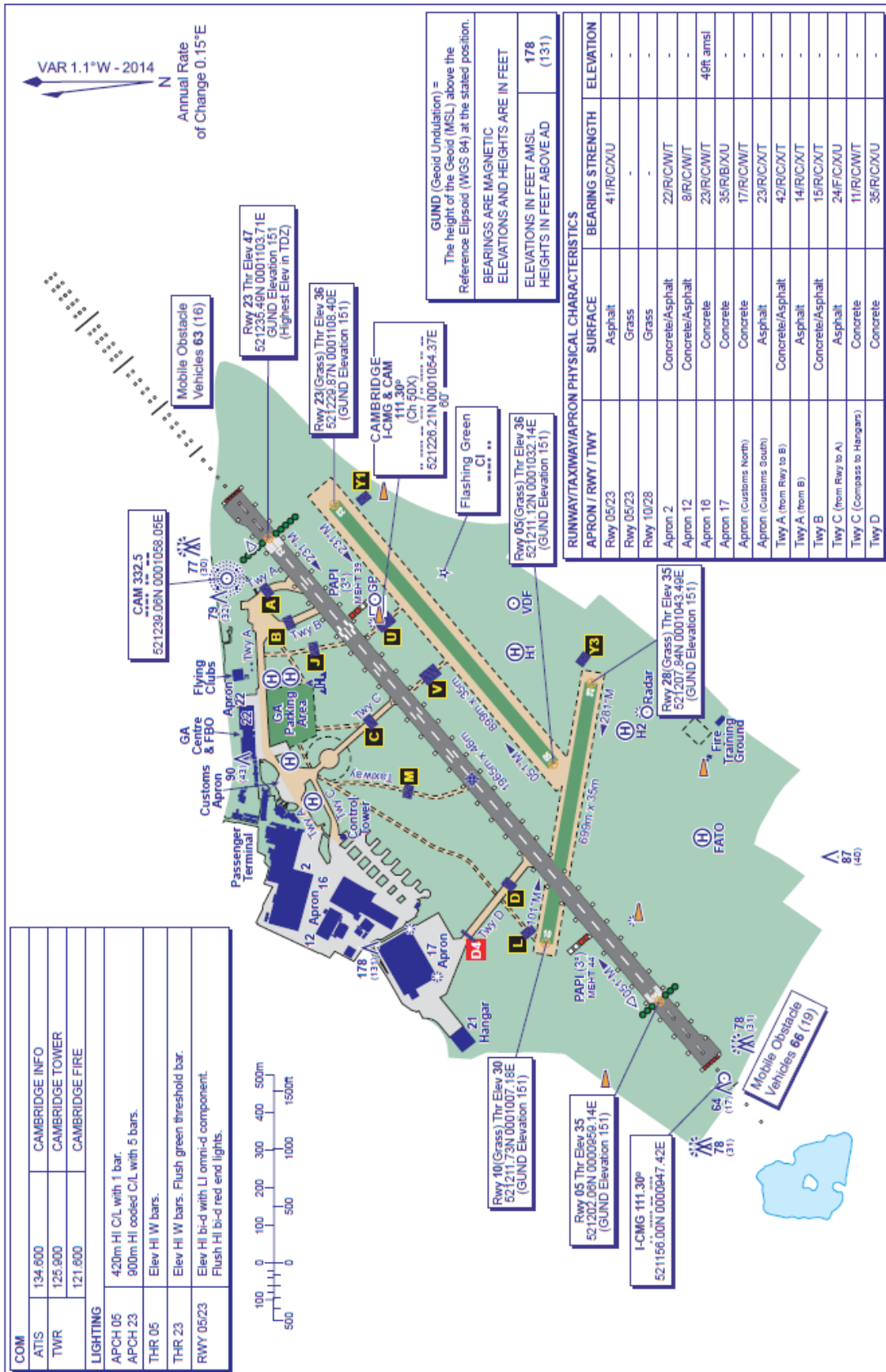
Figure 1: Aerodrome Chart